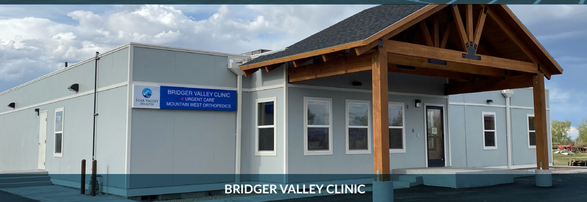
BRIDGER VALLEY CLINIC